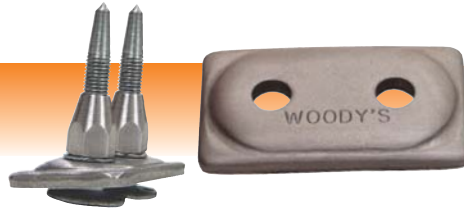
ANGLED DOUBLE DIGGER® SUPPORT PLATE

5/16" - 7" Angled aluminum support plate