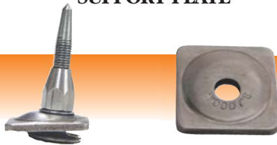
ANGLED DIGGER® SUPPORT PLATE

5/16" - 7" Angled aluminum support plate